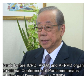
Recently before ICPD, APDA and AFPPD organized the International Conference of Parliamentarians on Population and Development (ICPPD)