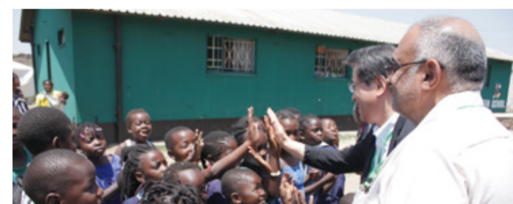
Asian and African Parliamentarians' Capacity Development on the Integration of Population Issues into National Development Frameworks – Part III, 2014, Zambia