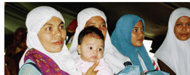
Visiting Programme for Tsunami Disaster Relief Project and Activation of Parliamentarian Activities on Population and Development, 2005, Indonesia