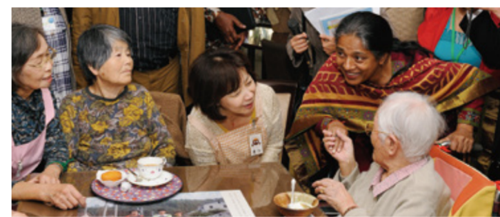
International Parliamentarians' Conference and Study Visit on Population and Aging, 2013, Japan