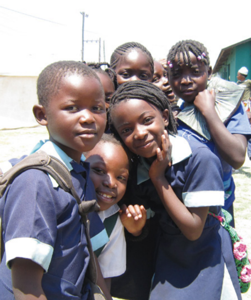
The Asian Population and Development Association (APDA)