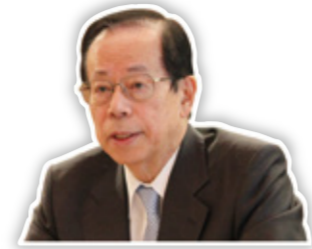
H.E. Yasuo Fukuda Former Prime Minister of Japan, Chair of APDA; Honorary Chair of JPPF

Given the finite capacity of the Earth it is clear that it will become increasingly difficult to sustain the improvement in the material standards of our lives. APDA is earnestly grappling with these challenges, to find what should be done to realize our goal of development that is sustainable anywhere in the world.