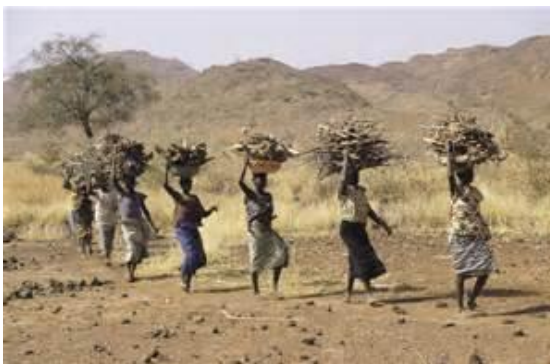
Deforestation as women use firewood for fuel in Zambia