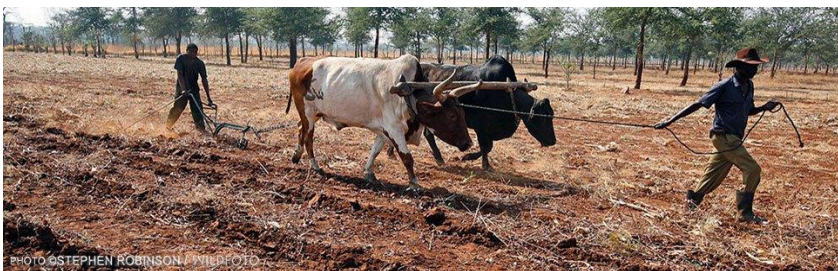
Poor farming methods contribute to deforestation and soil degradation in Zambia