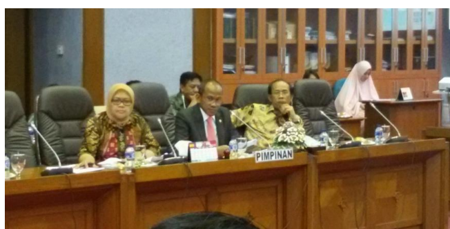
Parliament in Session in Indonesia, Jakarta

The Member said that while a lot remains to be done, she lauded the Parliamentarians for achieving the following;