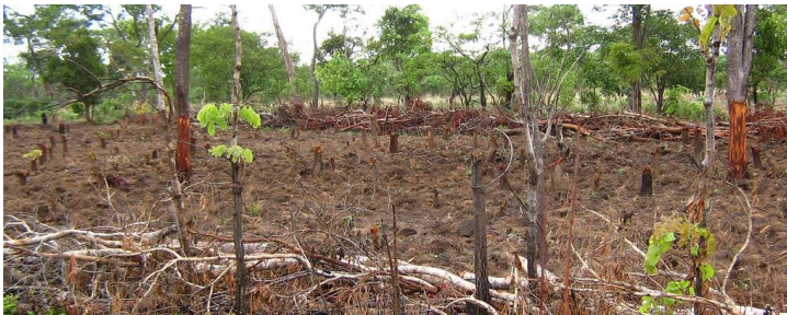
A section of deforested land in Zambia

For instance, in Zambia forests cover 60% of the country with some 45.8 million hectares of land that is being affected by a deforestation rate of approximately 300 000 hectares per year.