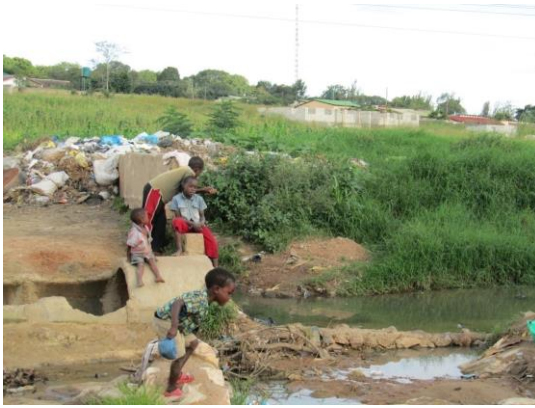
Pollution due to poor waste management and Sanitation in Zambia