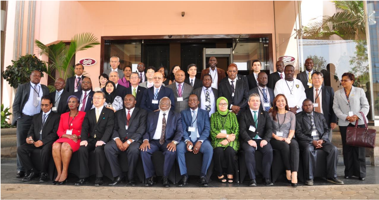
Honorable Delegates from Africa, Asia, Arab and European countries attending the Nairobi Conference on Enhancing the Role of Parliamentarians in the Interlinkage between Population Issues and the Post-2015 Development Agenda on 1 October 2015 - Crowne Plaza Hotel, Nairobi, Kenya