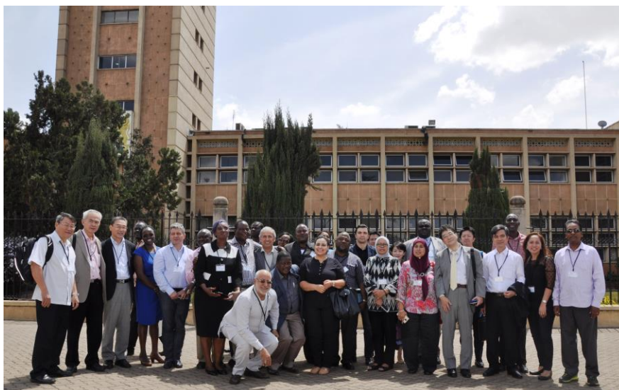
Delegates and participants group photo at Parliament Buildings

Thereafter, the delegates were taken on a tour of Parliament Buildings which included the Senate, Members Lounge and Gardens.