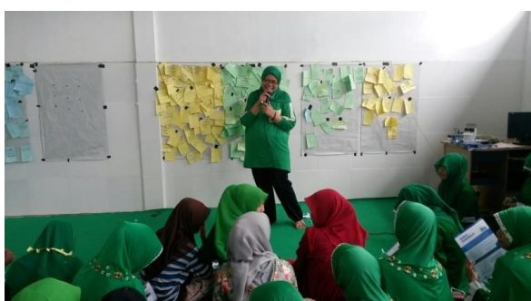
Women in a Family planning discussion in Indonesia

She stated that gains in family planning have stagnated in recent years and gender-based violence remains a pervasive problem.