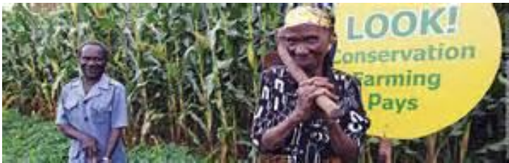
How proper farming methods can pay dividends

In conclusion, Hon. Mutale said that in order to build food resilience, it is important that agriculture thrives in our communities and countries. This is only possible if we view agriculture from the multifunctional angle which encompasses a healthy environment. Some of the issues to consider for food security are: