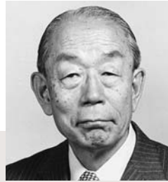
Second Chair 1979–1990

Hon. Nobusuke Kishi Former Prime Minister