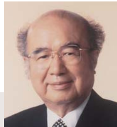
Fourth Chair 1991–2007

Hon. Shintaro Abe Former Minister of Foreign Affairs