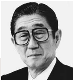
Third Chair 1990–1991

Hon. Shintaro Abe Former Minister of Foreign Affairs