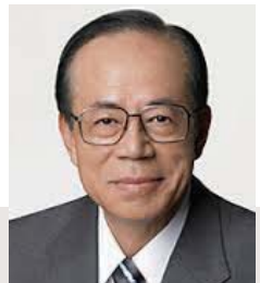
Fifth Chair 2007–2012

Hon. Dr. Taro Nakayama Former Minister of Foreign Affairs