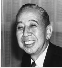
Founding Chair 1974–1979

Hon. Nobusuke Kishi Former Prime Minister