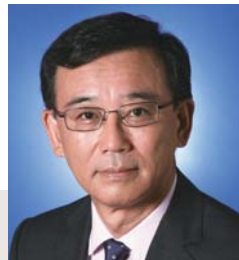
Sixth Chair 2013–Incumbent

Hon. Sadakazu Tanigaki Former Minister of Justice